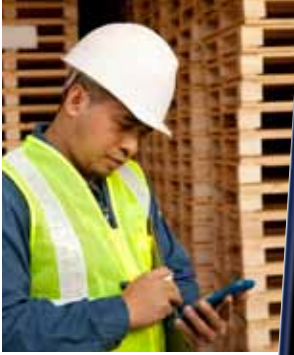
My Tasks: Each supervisor sees their own to-do list of tasks.